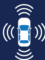
Advanced Driver Assistance Systems

The company recognized the potential safety risks associated with mobile device use and invested in a traditional approach to road safety to keep employees safe behind the wheel.